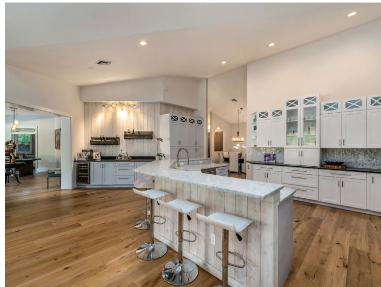
PALM BEACH POINT | $5,100,000

Spectacular 10-acre farm with room for a covered arena | 2 barns totaling 15 stalls | staff quarters | large all-weather arena | abundant turnout plus a gorgeous riding field | completely renovated home by Wellington's top builders and top interior designers | impact glass, gas range, and whole house generator