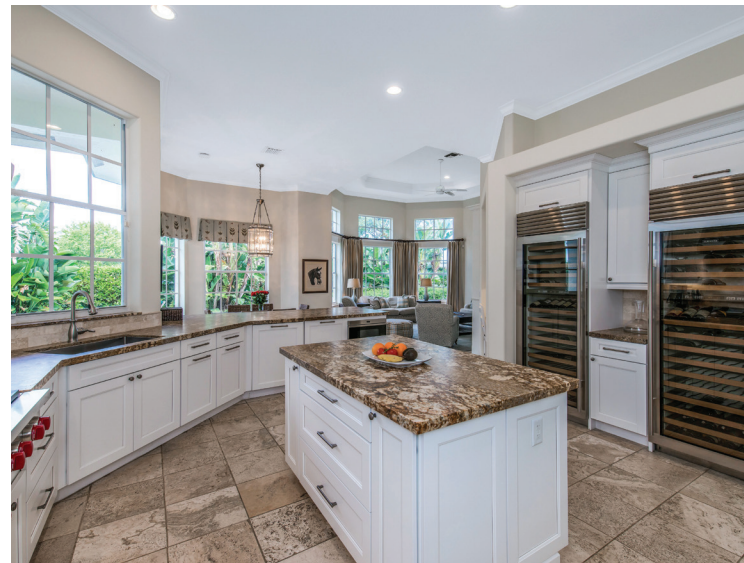
SADDLE TRAIL | $4,399,000 | PRICE REDUCTION

Meticulously renovated estate on 5.4 landscaped acres | 5 bedrooms, 4.5 bathrooms | split bedroom floor plan | impact glass | covered patio with summer kitchen and new pool | 8-stall center-aisle barn | 135' x 230' fiber footing riding arena and 7 paddocks