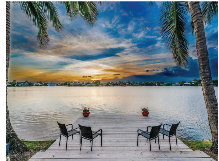
WILTSHIRE VILLAGE | $665,000

Perfect for the equestrian family | 5-bedroom, 6.2-bathroom estate in Palm Beach Polo & Country Club | masterfully redone | new roof, wood flooring, and upgraded kitchen and baths | impact glass windows and French doors | phantom screens | tropical pool area | prime location with a coastal feel