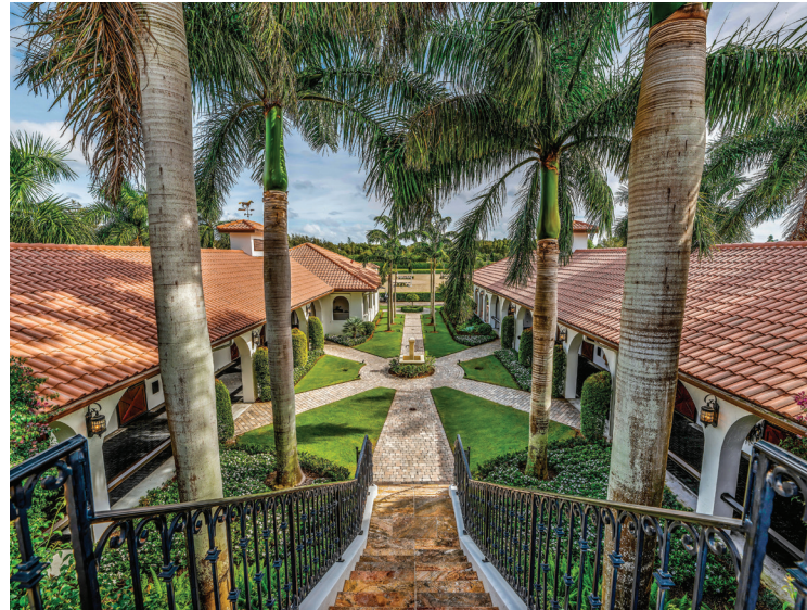
GRAND PRIX FARMS | $7,950,000

European-inspired estate on 4.11 acres | renovated in 2015 | 4 bedrooms with ensuite bathrooms and walk-in closets | private balconies | master suite with fireplace and marble master bathroom | wide-plank hardwoods and volume ceilings | oversized island | Wolf 6-burner gas range | French doors | Chicago brick patio with summer kitchen and saltwater pool | Lutron HomeWorks security system | 2 garages | full-service gym | 16-stall barn | 3-bedroom grooms' apartment | Aquaspa and equine treadmill | 4-horse Kraft walker | 7 paddocks | all-weather arena and grass jump field