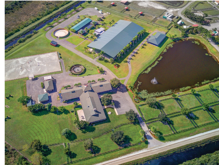
140 TH AVE. S | $9,650,000

Professional equestrian facility minutes from PBIEC | 14 stalls, 6 paddocks, and a 235' x 115' all-weather arena | large tack room, laundry facilities, and several feed rooms | owners' lounge featuring a timber ceiling, Saltillo tile, Wolf gas range, Sub-Zero refrigerator, and Miele dishwasher | two-bay garage for tractors and storage | grooms' lounge with kitchen | staff apartments with top-of-the-line amenities | outdoor patio complete with built-in Wolf grill, ice-maker, and mini-fridge overlooking the ring