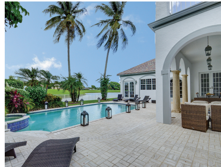
PALM BEACH POLO | BROOKSIDE 2 | $2,200,000

Pristine farm on almost 5 acres | on the bridle path to PBIEC | 2 barns sold turnkey totaling 12 stalls | automatic fly spray system | 12 irrigated paddocks | GGT arena and grass jump field | 4-bedroom, 4-bathroom home completely renovated in 2015 | gourmet kitchen with double ovens by Wolf | Sub-Zero fridge, 2 Sub-Zero wine fridges, and 2 Asko dishwashers | Sonos sound system and security cameras | reverse osmosis water treatment system | Co-listed by Sharon Loayza, who can be reached at 786-307-0689