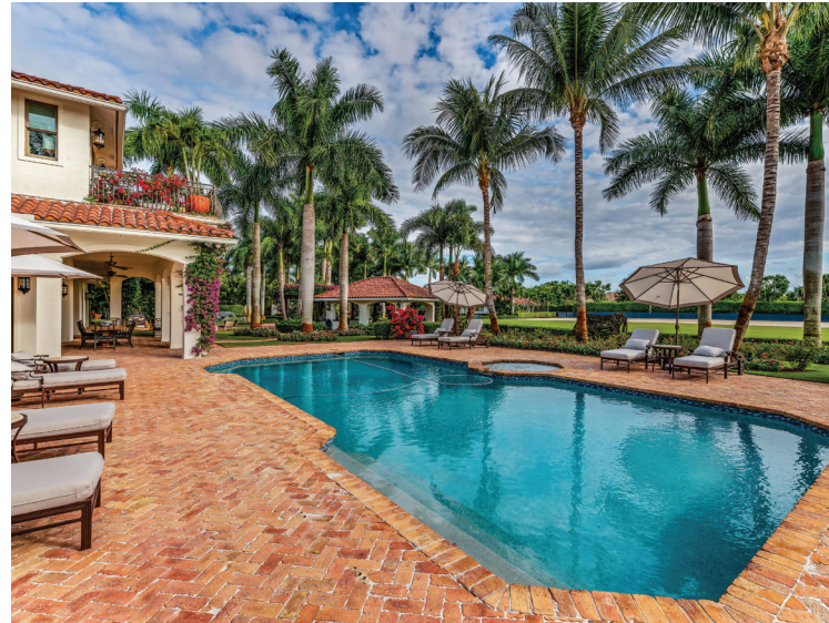
SADDLE TRAIL | $13,900,000

European-inspired estate on 4.11 acres | renovated in 2015 | 4 bedrooms with ensuite bathrooms and walk-in closets | private balconies | master suite with fireplace and marble master bathroom | wide-plank hardwoods and volume ceilings | oversized island | Wolf 6-burner gas range | French doors | Chicago brick patio with summer kitchen and saltwater pool | Lutron HomeWorks security system | 2 garages | full-service gym | 16-stall barn | 3-bedroom grooms' apartment | Aquaspa and equine treadmill | 4-horse Kraft walker | 7 paddocks | all-weather arena and grass jump field