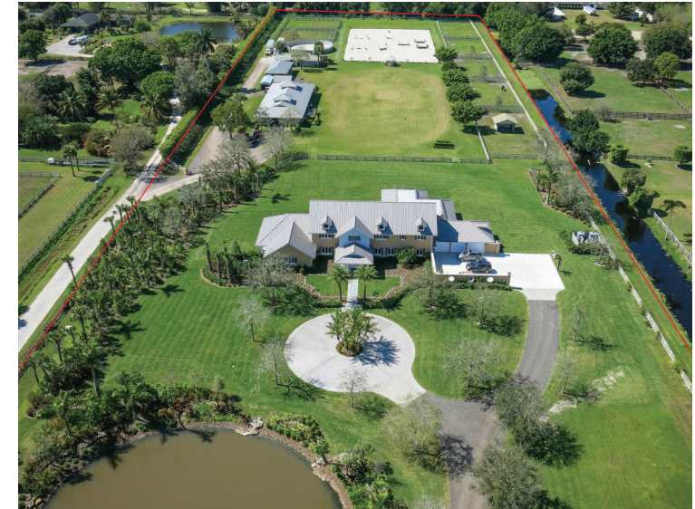
WELLINGTON SOUTH END | $9,900,000

Fabulous 15-acre professional equestrian facility | complete with large covered | additional all-weather arena | GGT footing | 42 stalls and 23 spacious paddocks | walker and round pen | 3-bedroom 2.5-bathroom main home | 1-bedroom, 1-bathroom guest house | numerous staff quarters | all overlooking a beautiful lake with a sunset view | Co-listed by Sharon Loayza, who can be reached at 786-307-0689